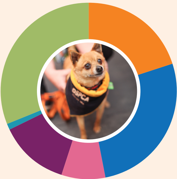
How we generated funds in 2023