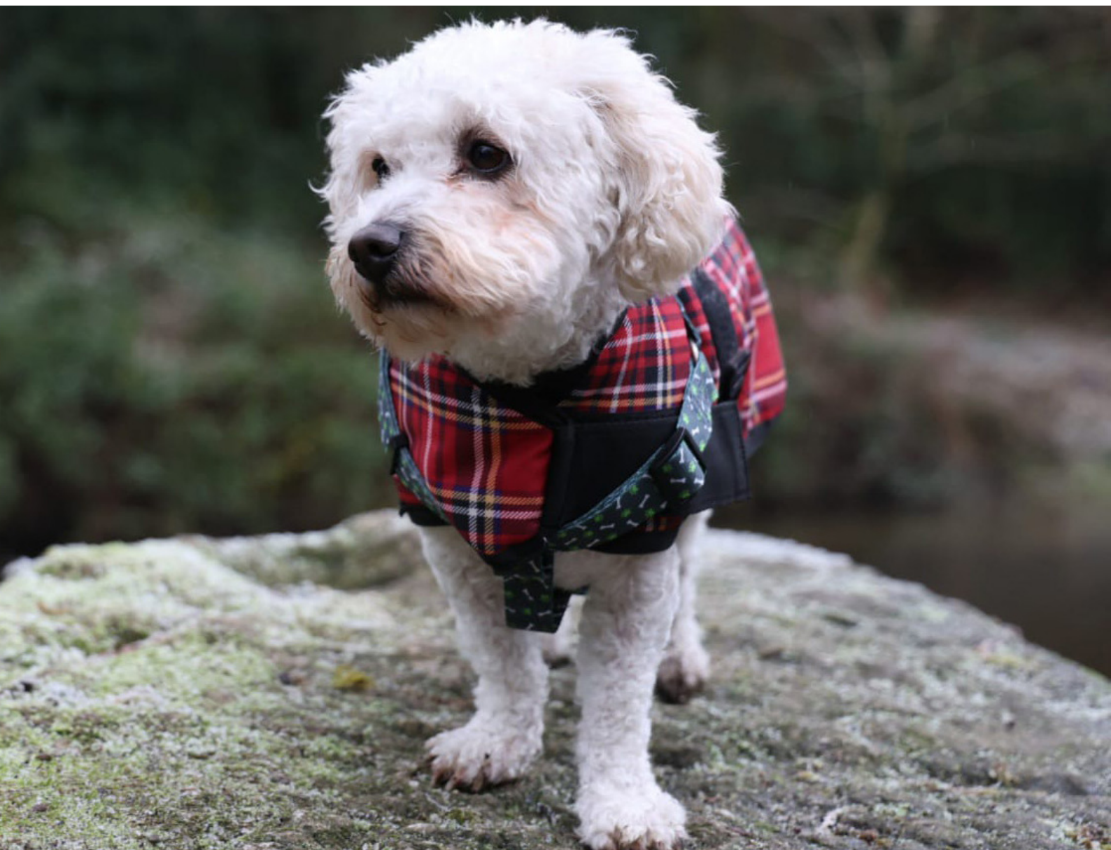
Rex the Bichon, with thick matted fur, removed by the veterinary team. Bottom: Rex today.