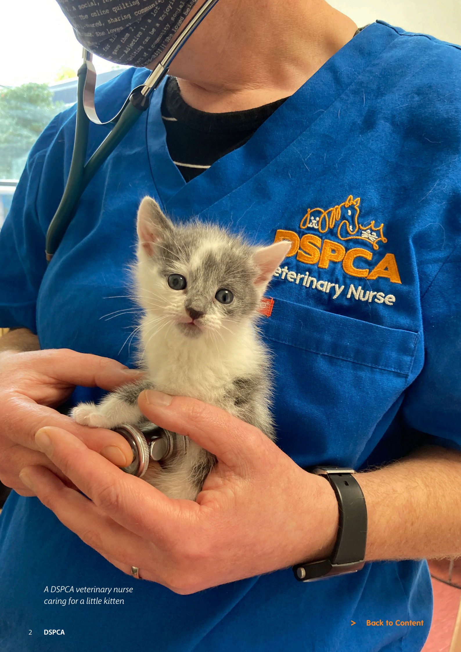
A DSPCA veterinary nurse caring for a little kitten