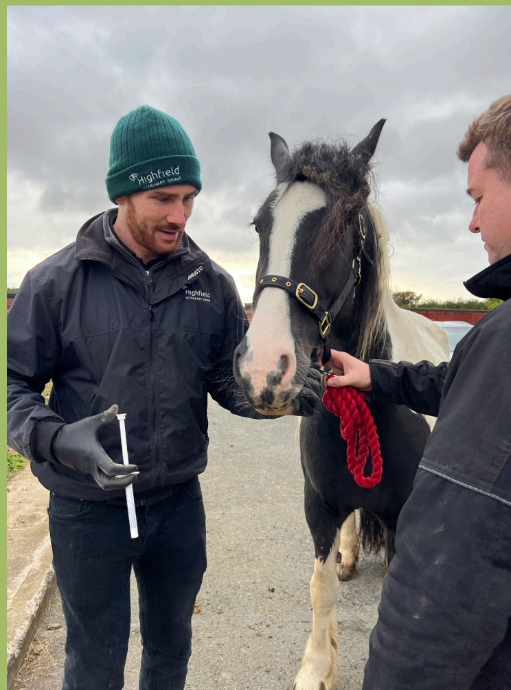
Vets working at Equine Worming Clinic, as part of the DSPCA outreach programme