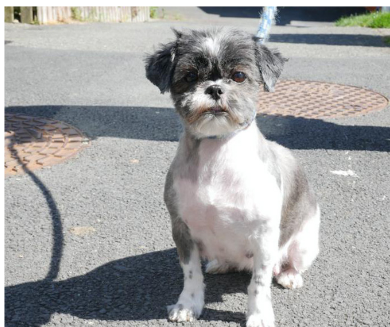
Animals rescued from Reynoldstown Farm, including Juno the Shih Tzu (bottom left). Juno today (bottom right).