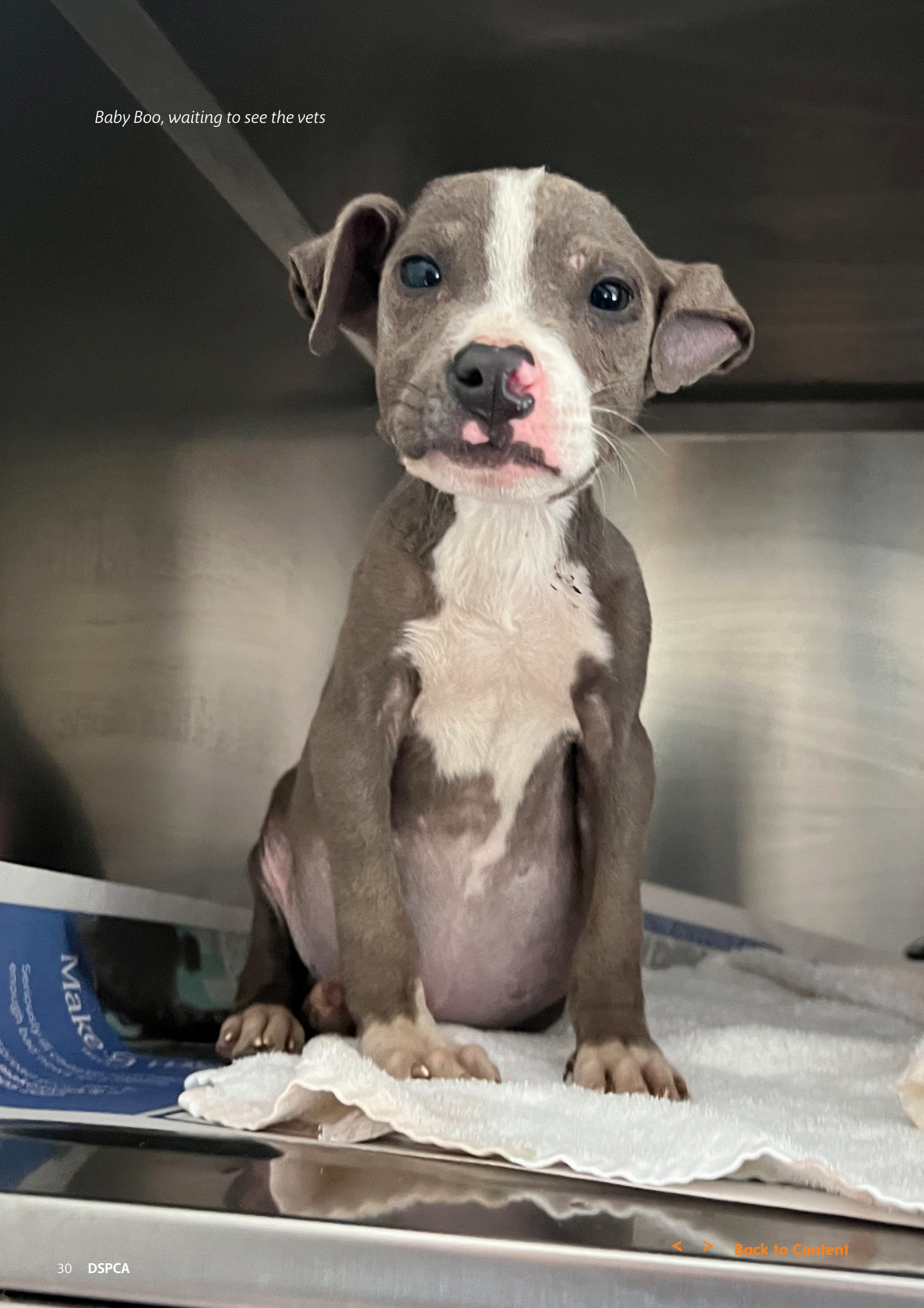
Baby Boo, waiting to see the vets