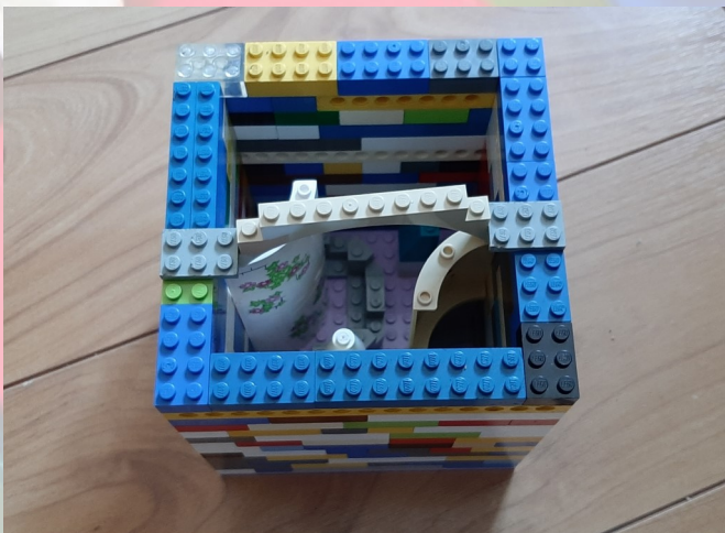
Step 3. Add some interesting shapes inside so your cat has to work for the treat.