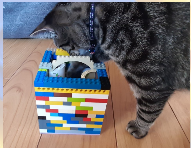
Step 4. Drop in some cat treats and watch your cat have fun!